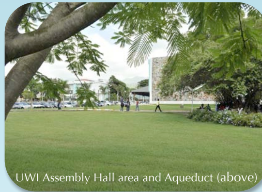
UWI Assembly Hall area and Aqueduct (above)