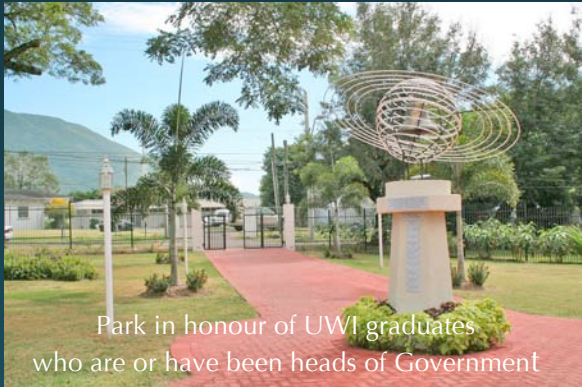
Park in honour of UWI graduates who are or have been heads of Government

“All praise this initiative that aims to free poetry from its tag as a ‘boring subject’ and relocate it in the minds of teachers and students as a lifelong gift to be savoured and treasured”